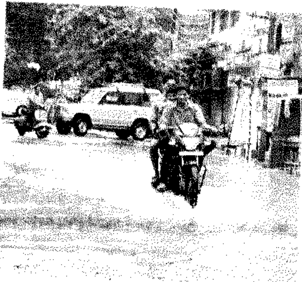
A motorist wades through a heavily water-logged road in Hyderabad. On the right, a rider braves heavy rains in Nellore on Sunday.

The city appeared battered despite GHMC reiterating that zonal officials of all the 18 circles were fully prepared and nearly 51 emergency handling teams were working. The waterlogged roads spoke of the failure in the functioning of the teams launched as part of the monsoon preparedness drive. Heavy rains were seen in Rajendranagar, Tolichowki, Langer Houz, Banjara Hills and is likely to continue for the next 24 hours.