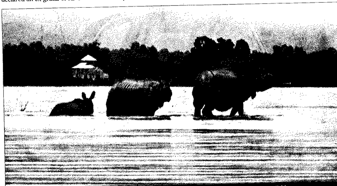
NO WAY OUT: One horned rhinoceros at a submerged area of the Kaziranga National Park in Assam on Friday.