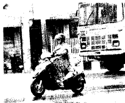
A woman rider is caught in the rains in Vizag on Sunday.

In Coastal AP, Marrupudi, Yerragondapalem in Prakasam, Srunigavarapukota in Vizianagaram and recorded rains of 3 cm each.