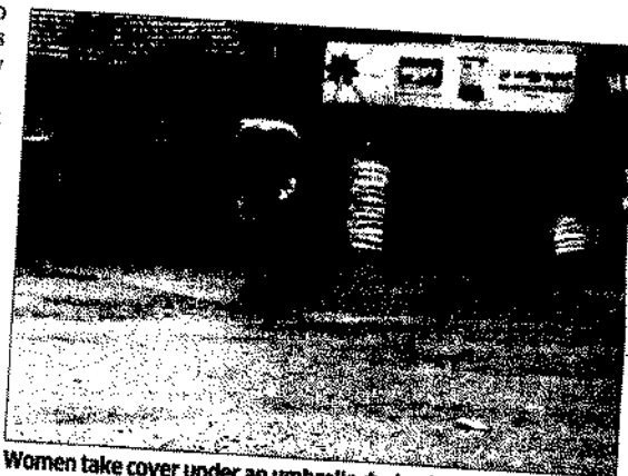
Women take cover under an umbrella during heavy rain in Somwarpet in Kodagu district. (Below) A part of the compound wall of the district stadium in Hassan collapsed due to rain on Saturday. DH PHOTOS

A portion of the compound wall of the district stadium and the underground drainage line in the city were damaged due to the showers, reports DHNS from Hassan.