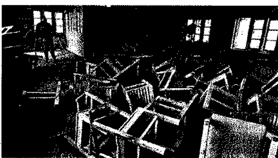
WHEN DISASTER STRUCK: A flood-ravaged classroom in a Srinagar school in 2014

Mirwaiz Umar Farooq, head of another Hurriyat faction, said, "The State government failed to compensate the flood victims and also