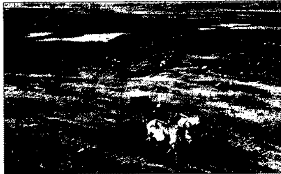
■ Tempers were high among farmers in this parched Maharashtra region over the government's alleged offhand response to three consecutive years of drought and mounting debts.

Tempers were high among farmers in this parched Maharashtra region over the government's alleged offhand