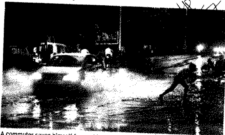
A commuter saves himself from a big splash in Rajahmundry after heavy rains inundated roads in the city on Sunday.