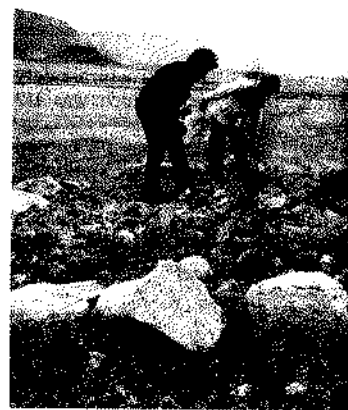
Archaeology officials looking at a site in the dry bed of Nagarjunasagar district.

However, the inhabitants were displaced and rehabilitated elsewhere when the impounding of water in the reservoir began in 1950s.