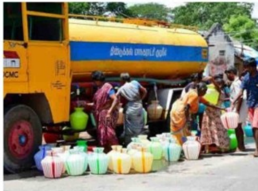
Every drop counts: People collecting drinking water from a tanker truck in Dindigul, Tamil Nadu.

This works out to a roughly 27% hike. The Swachh Bharat Mission-Rural that aims to "sustain" the open defecation-free (ODF) status in India's villages has been apportioned ₹77,000 crore, up